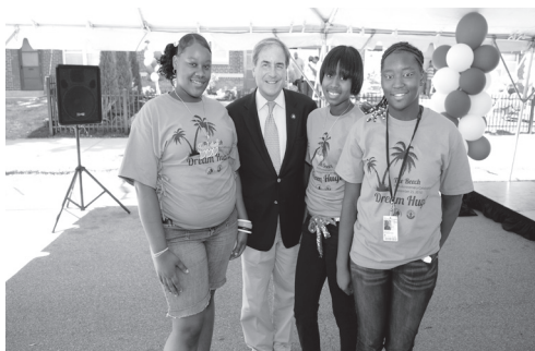
Congressman John Yarmuth takes time out for a photo with students following the event.